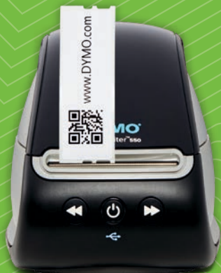
LabelWriter® 550 Item #DYM2112552