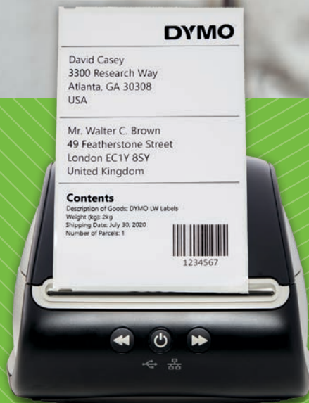
LabelWriter® 5XL Item #DYM2112554