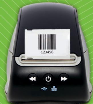
LabelWriter® 550 Turbo Item #DYM2112553