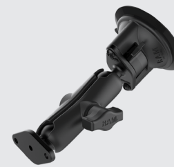
RAM® Twist-Lock™ Suction Cup Mount RAM-B-166U