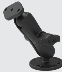
RAM® Double Ball Drill-Down Mount RAM-B-138U