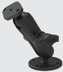
RAM® Double Ball Drill-Down Mount RAM-B-138U