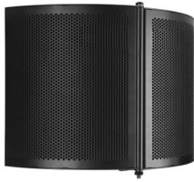
(1) Folding Sound Isolation Shield