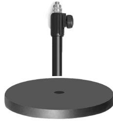
(1) Rod and Base

Use the diagram below to assemble your Sound Isolation Shield.