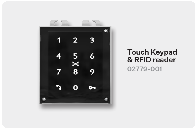
Touch Keypad & RFID reader 02779-001