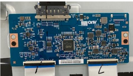
T-CON PWB (1pcs)