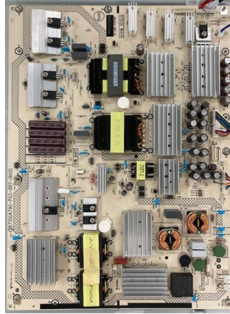
Power PWB (1pcs)