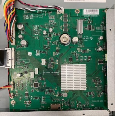
Main I/F PWB (1pcs)

All PWBs can be removed by screw driver.