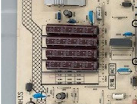
On Power PWB

Electrolyte Capacitors which diameter/height is larger than 25mm is installed on Power PWB. These capacitors can be removed by using nipper to cut the leads.