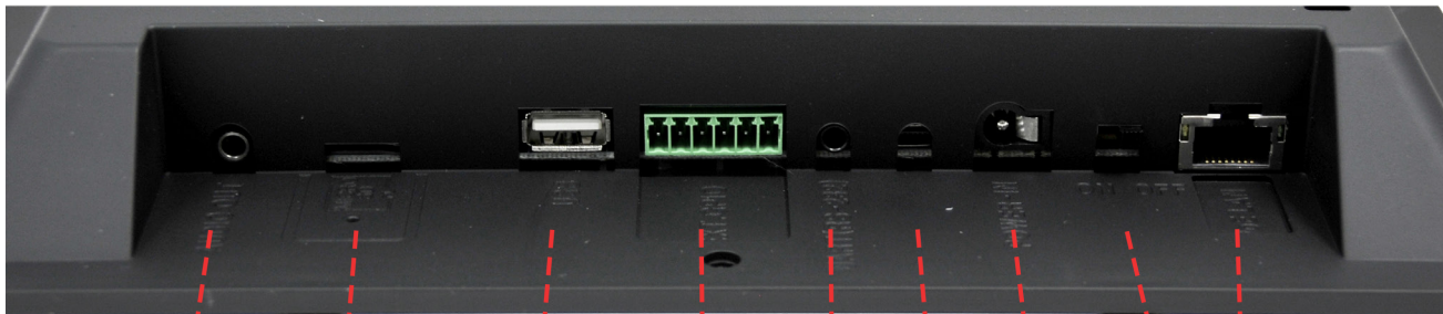
Audio SD Card USB Accessory GPIO Serial Service Not for Customer Use Power 12V/3A 5.5 x 2.1mm barrel Power Switch Ethernet with optional PoE