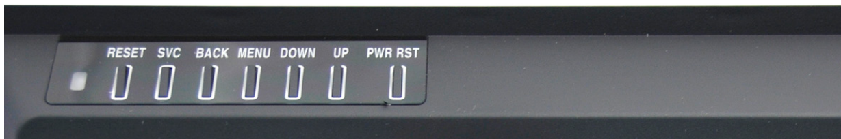
RESET SVC BACK MENU DOWN UP PWR RST