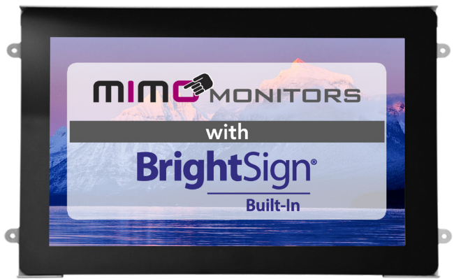
10.1" Open Frame