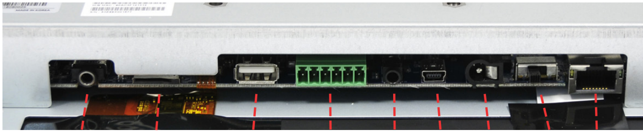
Audio SD Card USB Accessory GPIO Serial Service Not for Customer Use Power 12V/3A 5.5 x 2.1mm barrel Power Switch Ethernet with optional PoE