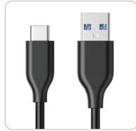
USB-C to USB-C Cable