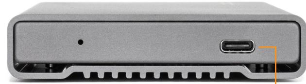
USB 3.1 Gen 2 Type-C 10Gb/s