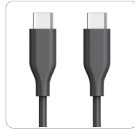
USB-C to USB Type-A Cable