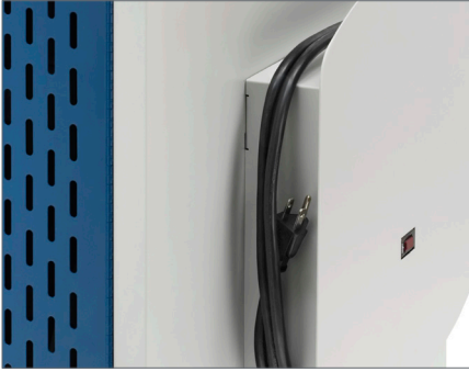
Cord Winder and Power Switch