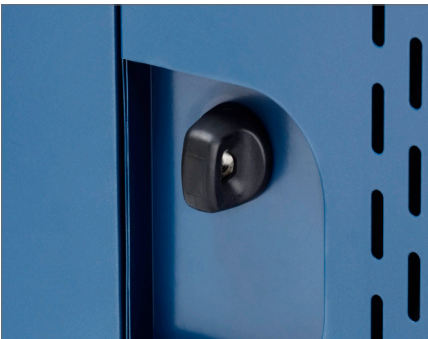
Using the Handle

Polypropylene dividers store devices vertically and offer optimal spacing for device compatibility.