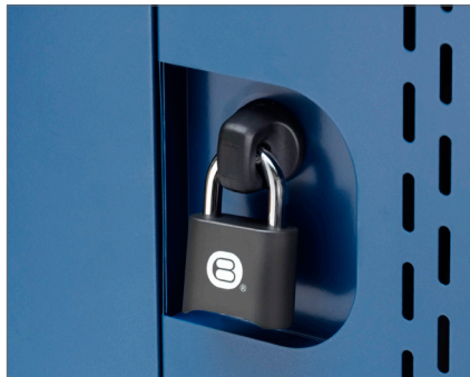
Inserting The Shackle / Lock Programming