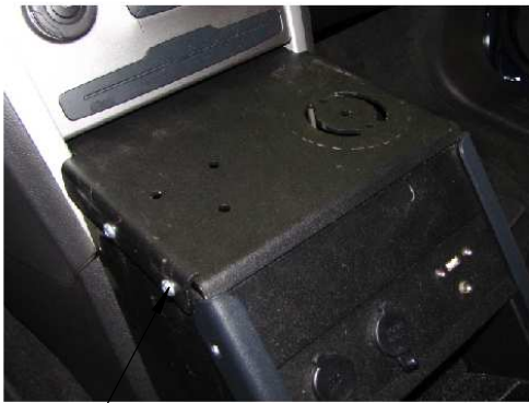
1/4-20 x 1/2" long socket button head screws

Step 6. Attach the main bracket to the vehicle specific console box with the (4) 1/4-20 x 7/8" long socket button head machine screws provided in the hardware bag.