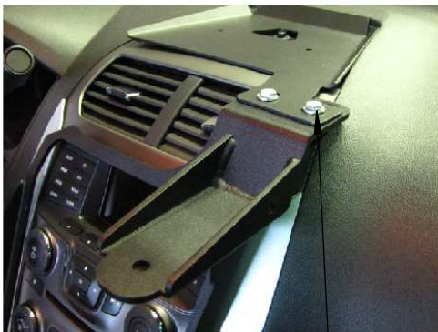
3/8-16 x 3/4" long hex bolts and flat washers

Step 6. Attach the custom clevis (7110-1205) with the 3/8-16 x 1.25" long hex bolt washers and nylock nut provided in the hardware bag. See next page for exploded view of attachment.