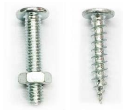
(2) Nuts with bolts