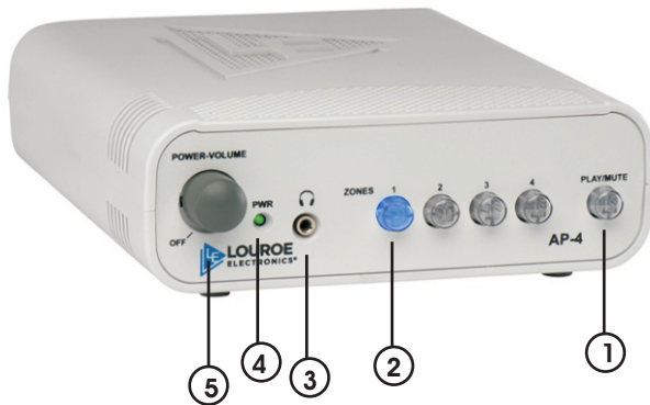
Fig.1 Front view of AP-4

AP-2 and AP-8 have the same features except for the number of Zones