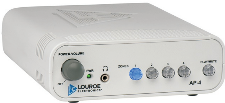
Model AP-4 4 Zone Audio Base Station

The ASK-4® 104 is a four zone audio monitoring system designed to interface with a DVR, VCR or other recording device that accept line level audio. The AP-4 Audio Base Station has 4 microphone inputs, contains a built-in 3' speaker and volume control for producing live audio and playback. It has loop out RCA output per microphone so each microphone can be recorded individually. It also has a selectable audio output that produces audio to a recorder for that zone or microphone selected. The Verifact™ A microphones are omnidirectional pre-amplified microphone that produces line level audio output.