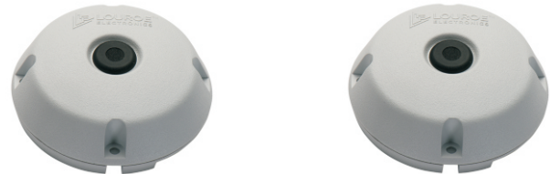
Verifact® A Microphones