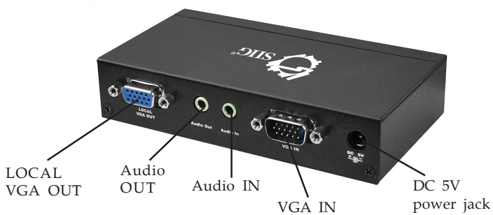
Figure 1: Front view