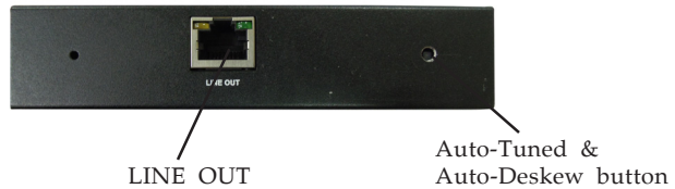
Figure 2: Rear view