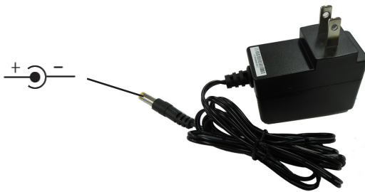
Figure 4: Power Adapter