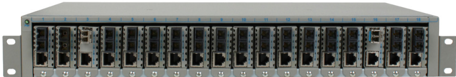
Figure 1: miConverter 18-Module Power Chassis

The miConverter 1.5U (2.5 inch) 18-Module Power Chassis is powered by an AC or DC power supply and can accommodate up to eighteen miConverter media converters. This compact chassis is ideal for consolidating individual media converters into a high-density form factor utilizing a single reliable power supply. The chassis can be rack mounted in a 19” or 23” equipment rack.