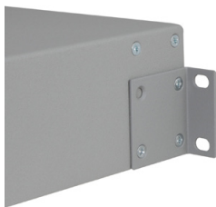
Figure 2: Lower Rack Mount Position

When rack mounting the chassis to a 19” standard rack, first attach the two enclosed “L” shaped rack mounting brackets to the chassis using the enclosed screws. The rack mounting brackets can be attached to the chassis using two different hole patterns, depending on the mounting requirement. The different hole patterns will allow two chassis to be installed in a 3U rack space.