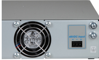
Figure 4: NEBS Grounding Lugs

The chassis provides NEBS ground posts to secure a grounding lug and wire from the chassis to the ground post.