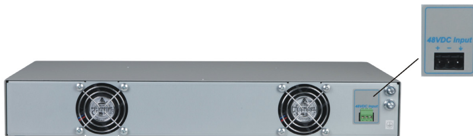
Figure 6: DC Powered Chassis

NOTE: The fans will not operate until the internal ambient temperature reaches appropriately 50° C. The fans will turn off once the internal ambient temperature drops below appropriately 40° C.