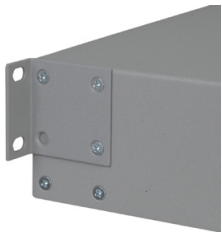
Figure 3: Upper Rack Mount Position

Mount and attach the chassis (after the mounting brackets are installed) to the rack using the appropriate rack mounting screws (not provided). For optional 23” rack mounting, attach the mounting bracket in the same manner as shown above.