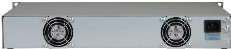
Figure 5: AC Powered Chassis

NOTE: The fans will not operate until the internal ambient temperature reaches appropriately 50° C. The fans will turn off once the internal ambient temperature drops below appropriately 40° C.