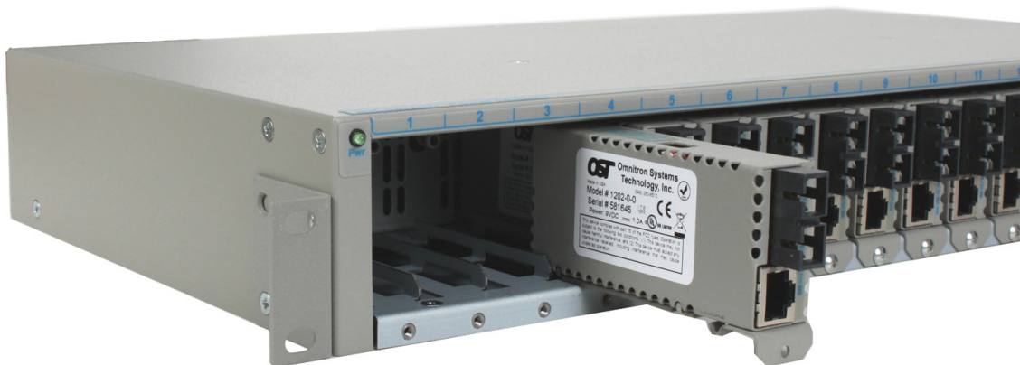
Figure 8: Module Insertion

NOTE: Remove any rubber feet from the module before installing it into the chassis.