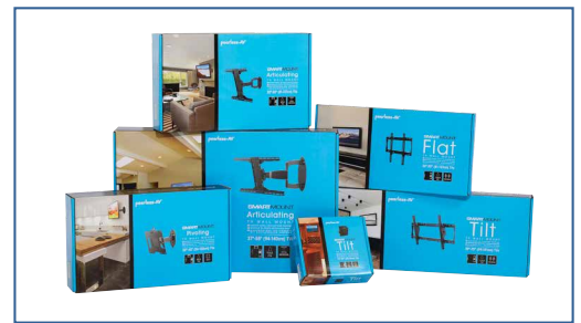
Comes in color packaging with included installation hardware and easy to follow instructions.