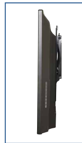
Low-profile design for a sleek, yet compact installation.