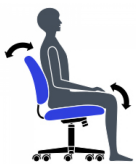
Chair Tilt Lock