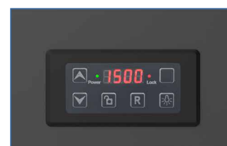
Integrated digital controls at the rear of the cart