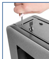
Display Height Adjustability