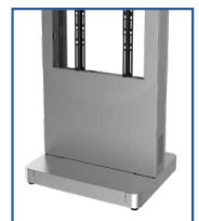
Wheel Base KIPC2555B(-S)-3-WHL Models Available

Please visit peerless-av.com/en-us/patents for patent information.