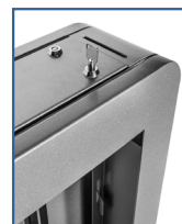
Keyed-Alike Cam Locks