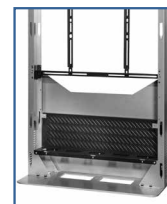
Component Tray & Shelf