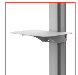
Shown with Rear Metal Shelf (ACC-MSF-W)

4" (102mm) swivel casters (two locking) meet UL/CUL requirements