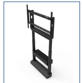
Shown with Optional Standoff Plate (ACC114) to Provide 3.5", 4", 4.5" or 5" of Clearance Between the Stand and the Wall