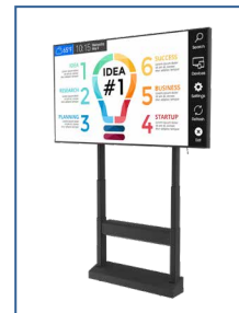
Shown with Display

Allow the stand to be positioned properly, even on unlevel surfaces