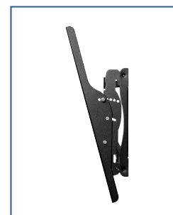
IncreLok™ Tilt Technology