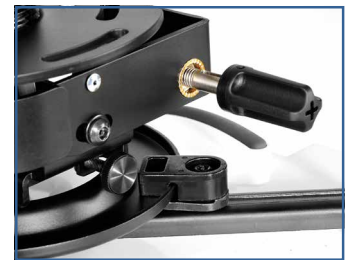
Pin-Point Image Alignment

Spider® Universal Adaptor Plate extends up to 17.63" (448 mm) to fit most projector models