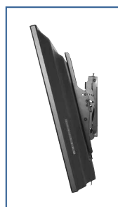
+15°/-5° of tilt for versatile viewing angles.