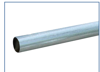
Zinc-plated model shown, MOD-P100/P150/P200/P300