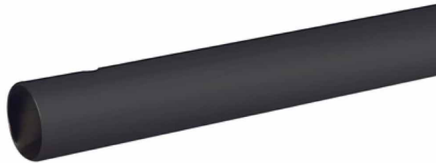
Black model shown, MOD-P100-B/P150-B/P200-B/P300-B