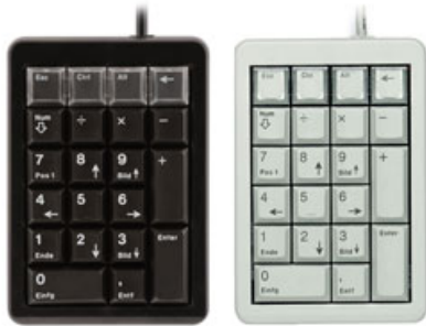
Models may vary from the image shown