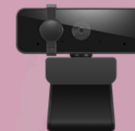
Lenovo Essential FHD Webcam Gen2 4XC1S15018