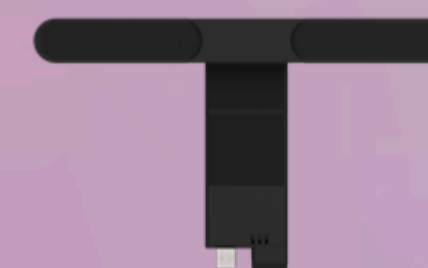
ThinkVision MS30 Monitor Soundbar 4XD1J05151

Please click here to view the full list of accessories.