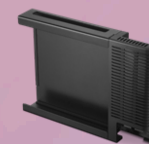
ThinkCentre Tiny Mounting Kit 4XF1R07369