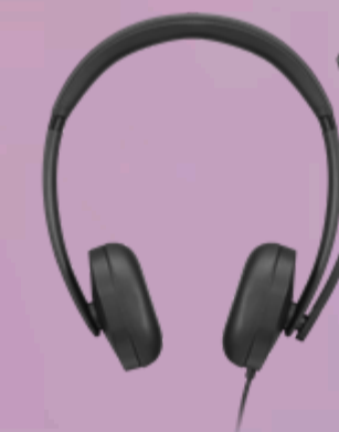
Lenovo Wired VoIP Headset 5000 4XD1R88995

Please click here to view the full list of accessories.