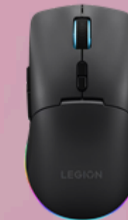
Lenovo Legion M220 Wireless RGB Gaming Mouse GY51U28359