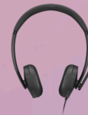
Lenovo Wired VoIP Headset 5000 4XD1R88995