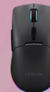
Lenovo Legion M220 Wireless RGB Gaming Mouse GY51U28359