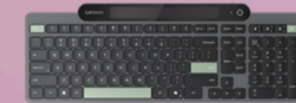
Lenovo Self-Charging Bluetooth Keyboard-French Canadian 058 4Y41R69498

Please click here to view the full list of accessories.