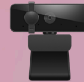
Lenovo Essential FHD Webcam Gen2 4XC1S15018