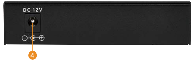
Model: N786-MDC-SFSPSFP (rear)