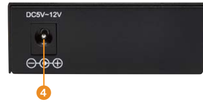
Model: N786-001-SFP (rear)