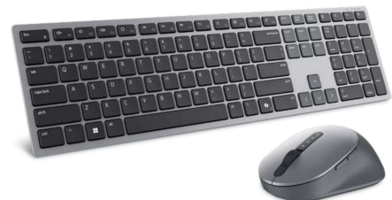
Dell Pro Plus Keyboard and Mouse - KM7321W

Ensure same time delivery and easy setup with Dell drop-in-box wireless keyboards and combos. Dell wireless keyboards offer up to 36 months of battery life for long-term performance 1 . Select models include a Copilot key for instant AI access and silent keys for quiet, focused typing in open office environments.