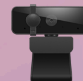
Lenovo Essential FHD Webcam Gen2 4XC1S15018