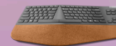
Lenovo Go Wireless Split Keyboard-US English 4Y41R64755

Please click here to view the full list of accessories.