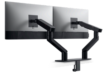
DELL DUAL MONITOR ARM | MDA20

Easily attach your Dell Dock to the Dell Dock Mounting Kit and mount it behind a monitor, to a wall or under the desk for a clutter-free workspace.