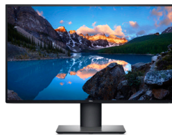
DELL ULTRASHARP 27 4K USB-C MONITOR | U2720Q

Designed to work seamlessly across 3 devices, this compact keyboard mouse combo keeps your desk clutter-free and lets you stay productive with up to 36 months 25 of battery life.