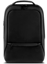
DELL PREMIER SLIM BACKPACK 15 | PE1520PS

Compact and portable 7-in-1 USB-C mobile adapter provides superb video, data connectivity and up to 90W power pass-through to your PC.