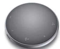
DELL MOBILE ADAPTER SPEAKERPHONE | MH3021P

Experience captivating details and true-to-life color reproduction on this brilliant 27" 4K monitor with a wide color coverage.