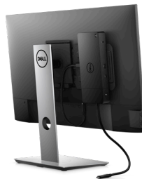
DELL DOCKING STATION MOUNTING KIT | MK15

Work at full speed with Dell's powerful Thunderbolt Dock. Charge your system faster, support up to two 4K displays and connect to your peripherals via a single cable.