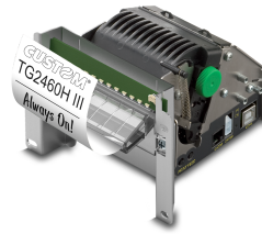
915CG060200300 PRINTER TG2460HIII USB RS232 CUT HC STD