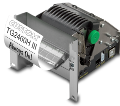
915CG050141300 PRINTER TG2460HIII USB TEAR OFF TRASP. BEZ