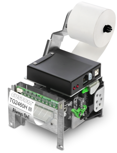
915CG060300300 PRINTER TG2460HIII USB RS232 CUTTER EJECTOR

Via Berettine, 2 - 43010 Fontevivo PR - VAT: IT02498250345 - TEL: +39 0521 680111 - FAX: +39 0521 610701 - UNIQUE CODE: 8RQN7AZ