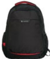
Dynabook Backpack (OA1207-CWTBP)