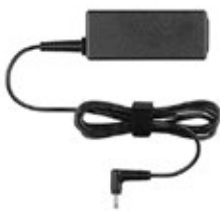
Additional dynabook Universal 45W AC Adaptor (PS0131EA1ACA)