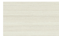
WHC White Chocolate