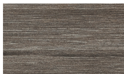
ACJ Absolute Acajou