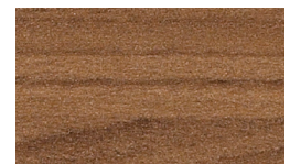
WCR Winter Cherry