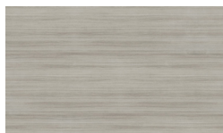
NGL Noce Grigio