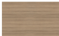
NML Noce Medio