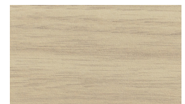
NBL Noce Biondo