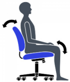
Chair Tilt Lock