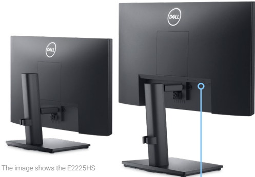
The image shows the E2225HS