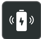
Up to 32 hours Talking Time