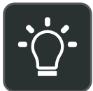
Hybrid Visual Busylight