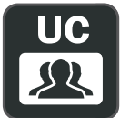
Compatible with mainstream UC platforms