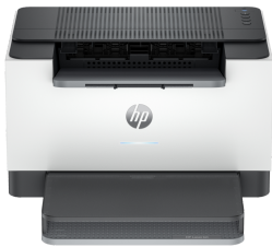
HP LaserJet M207dw Printer

This printer is intended to work only with cartridges that have a new or reused HP chip, and it uses dynamic security measures to block cartridges using a non-HP chip. Periodic firmware updates will maintain the effectiveness of these measures and block cartridges that previously worked. A reused HP chip enables the use of reused, remanufactured, and refilled cartridges. More at: http://www.hp.com/learn/ds