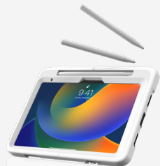
STYLUS PEN SLOT