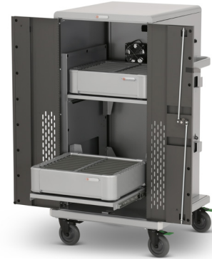
PowerSync Pro™ Gen. 2 Cart PSPCART-PMCK