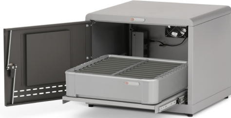
PowerSync Pro™ Gen. 2 Cabinet PSPCAB-PMCK