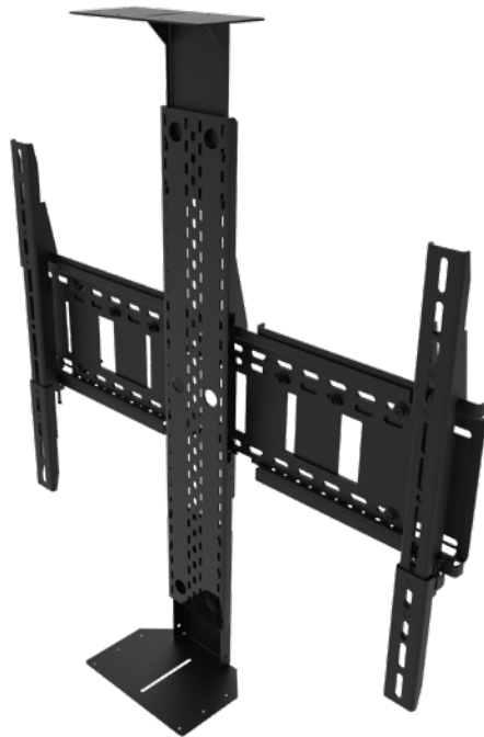
PS-50 Mount shown on UM-1