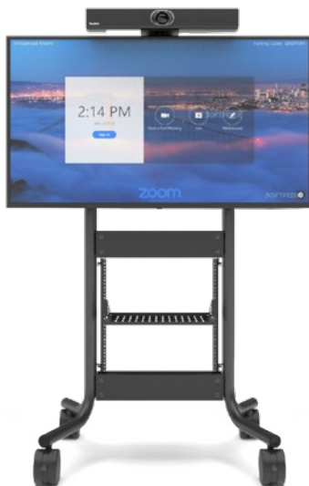
Yealink MeetingBar Mount shown on RPS-500