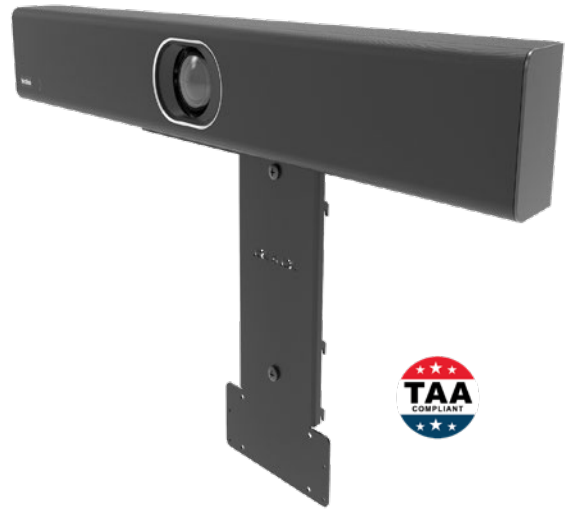
MeetingBar A20/A30 Mount