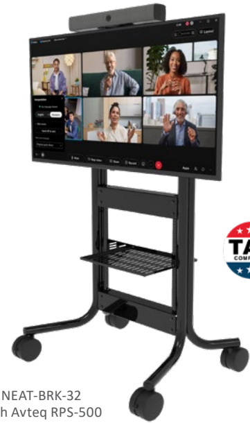
NEAT-BRK-32 with Avteq RPS-500