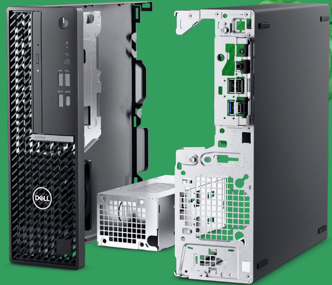
A look inside: Post-industrial recycled steel

OptiPlex is passionate about reducing our products' carbon footprint and helping our customers make an impact on the future. Committed to circular design throughout the lifecycle, we're driving the innovative use of materials, packaging, energy conservation, recycling and even reparability.