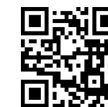
ExtremeCloud IQ Companion Android Mobile Application

Use your mobile device camera to scan the serial number, capture installation images, assign or change device location, and network policy. The ExtremeCloud IQ Companion Mobile Application enables you to access the device CLI for troubleshooting and view device and client status.