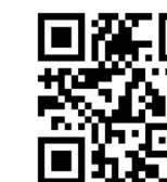
ExtremeCloud IQ Companion Mobile Application Onboarding