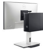
Precision All-in-One Display and Stand | CFS25

Be your most productive on a 27 inch monitor with brilliant color and contrast that features the industry's first IPS Black technology and a connectivity hub. 1