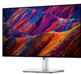
Dell UltraSharp 27 4K USB-C Hub Monitor | U2723QE

Designed, tested and certified to work seamlessly together with Dell systems. We offer full productivity and collaboration solutions as well as mounting kits and Rack Shelf for the data center.