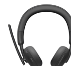
Dell Wireless Headset | WL3024

Create an unequalled 3D navigation experience with the most ergonomically designed product 3Dconnexion has ever created.