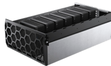
Hypershelf for Precision 3280

Elevate your video conferencing experience on this powerful, intelligent 4K webcam that optimizes your visuals with a large 4K Sony STARVIS™ CMOS sensor and AI Auto-Framing.