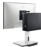
Precision All-in-One Display and Stand | CFS25

Be your most productive on a 27 inch monitor with brilliant color and contrast that features the industry's first IPS Black technology and a connectivity hub. 1