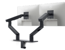
Dell Dual Monitor Arm | MDA20

Mount your Precision on the All-in-One Display and Stand to save space.