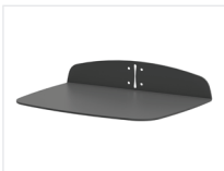
UTILITY SHELF DARK GREY 97-507-282

Additional accessories available in white