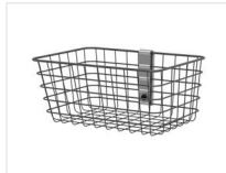
SMALL WIRE BASKET DARK GREY 98-136-282